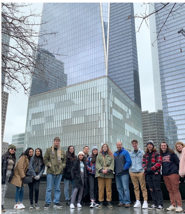
Patchogue-Medford High School (NY) at the 9/11 Memorial and Museum in March!