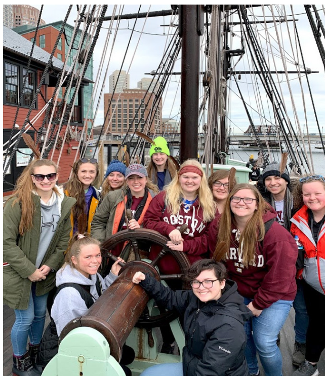
Brown County High School (IN) visiting Boston and the Tea Party Museum in March!