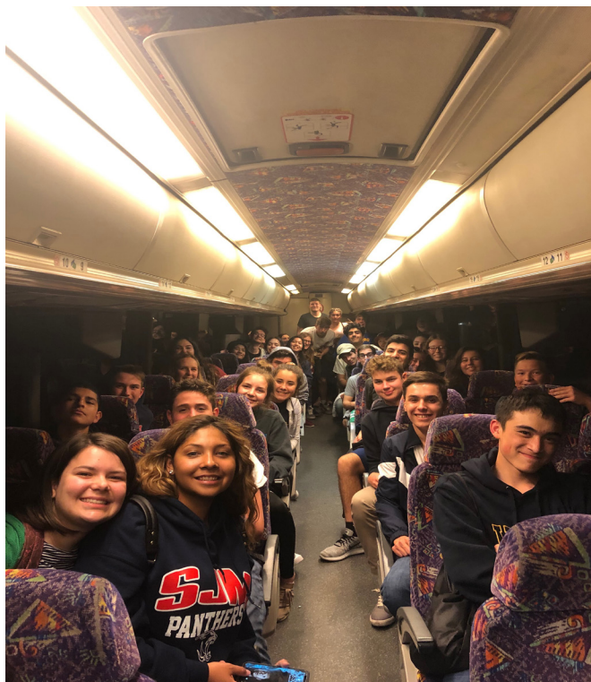
San Joaquin Memorial High School (CA) traveling to the Museum of Tolerance in LA!